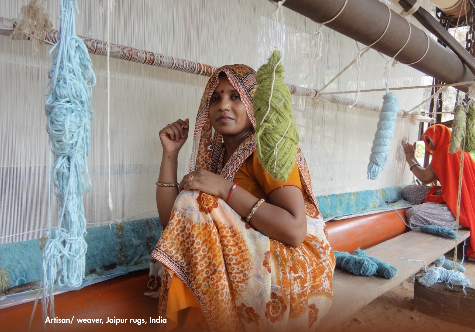
Artisan/ weaver, Jaipur rugs, India